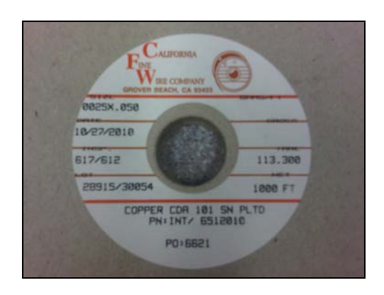
Figure 4 Pancake w/ PSI, doughnut & Start.