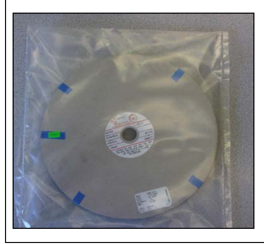
Figure 5 Various sizes of Pancake spools in plastic wrapping. Also showing securing tape placements.