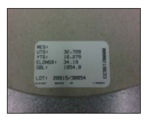
Figure 3 Start sticker on Pancake spool.